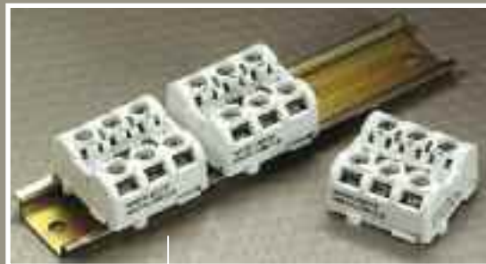
The new Mini Switch Monitor can act as an interface.