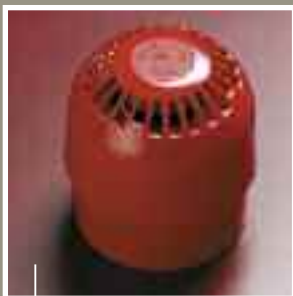
Intelligent Open Area Sounder coming soon.

In response to customer suggestions, Apollo is developing a new, smaller Mini Switch Monitor that can act as an interface where space is limited. Measuring just 39mm x 39mm x 20mm, the new device can be DIN rail mounted or fitted into the backbox of a manual call point. The new Mini Switch Monitor reports the contact status of one or more open switches on a single pair of cables and offers isolate, interrupt and non-interrupt functions in a single unit. Three coloured LEDs give clear indication of status and there is a pre-alarm as standard. This new version will replace all existing models.